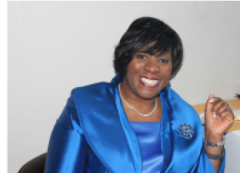
Minister Christina Greenaway