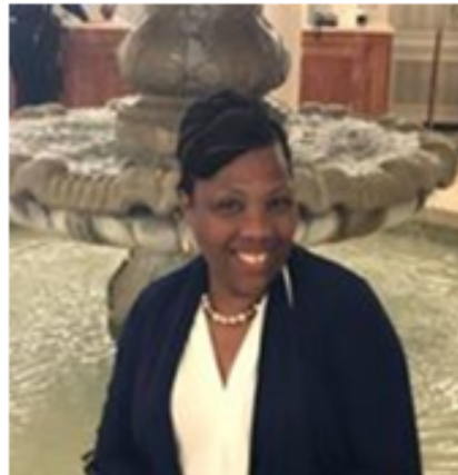
Minister Viveen Murray